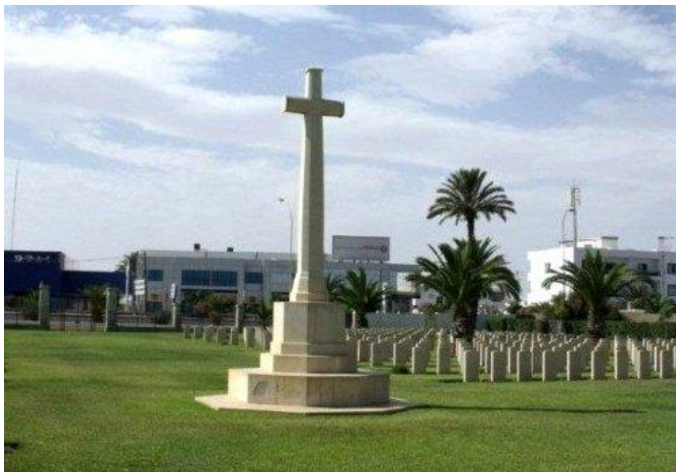
Sfax War Cemetery, Tunisia