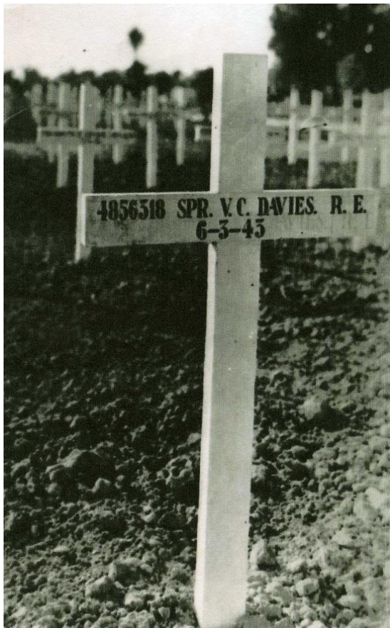
Sfax War Cemetery Tunisia